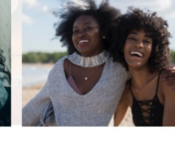
Circles A sisterhood of women

A sacred space for us to connect more deeply with ourselves and each other