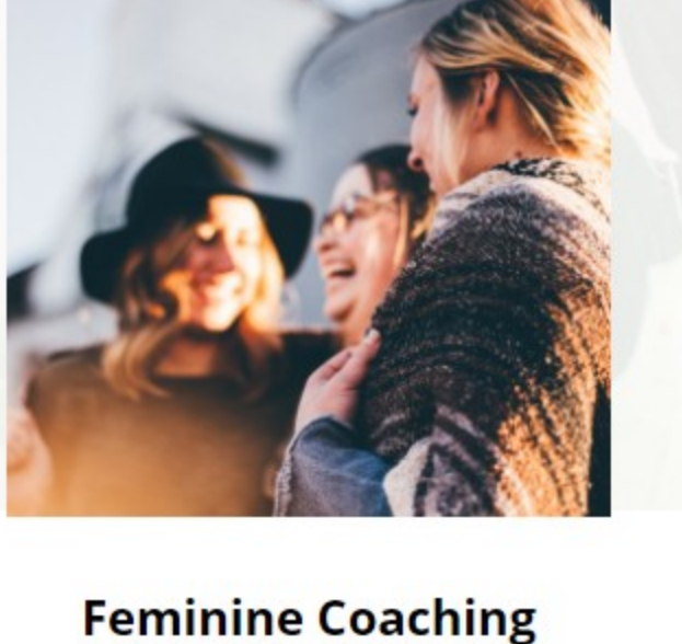
& Conversations Pinpoint and transform

Tools and techniques that restore you to your natural femininity in work, life, and relationships